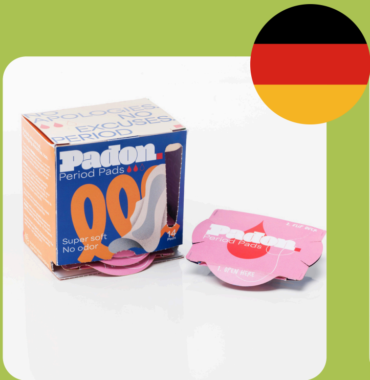
Creative Cartonboard Packaging All other