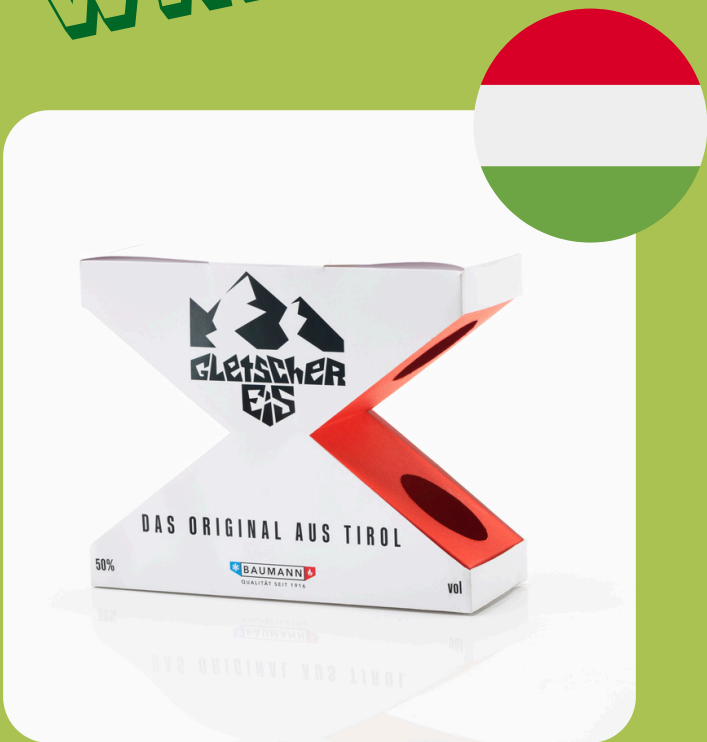
Creative Cartonboard Packaging Food & Drink