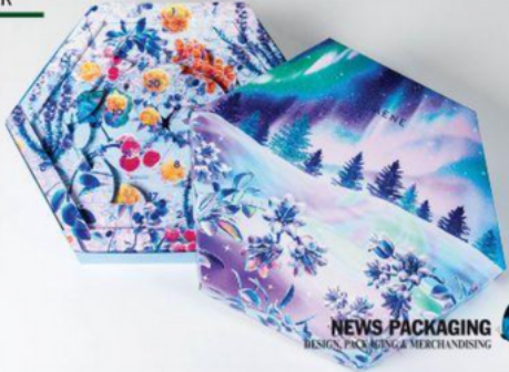
NEWS PACKAGING DESIGN, PACKAGING & MERCHANDISING

PRO CARTON EUROPEAN CARTON EXCELLENCE AWARD 2025 WINNER CARTON OF THE YEAR