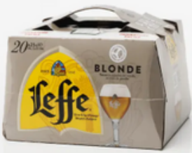
Innovation Award Winner: Leffe Beer Multinack