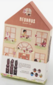
Public Award winner: Neuhaus Easter Filled Figures