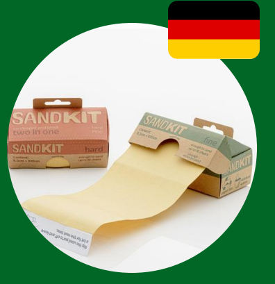
Creative Cartonboard Packaging All Other