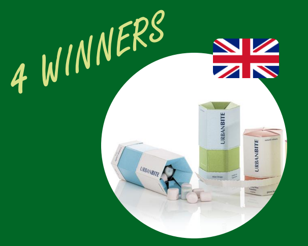
Creative Cartonboard Packaging Food & Drink