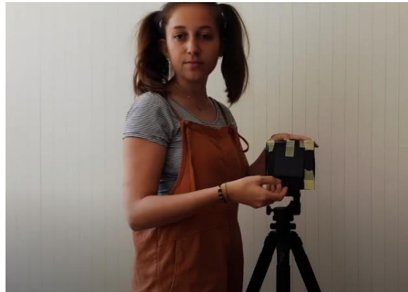
The winning entries of 2020