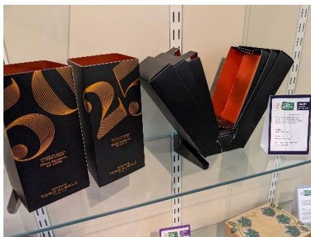
Carton of the Year: Bodegas Balsamic