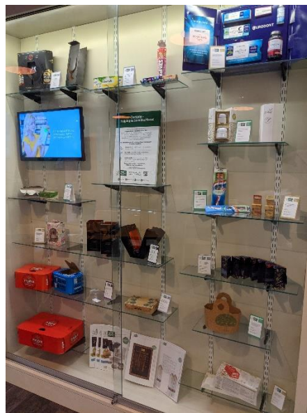
European Carton Excellence Award Winners 2021 display at the Museum of Brands

The Museum of Brands is home to over 12,000 exhibits, showcasing internationally renowned brands, packaging, and advertising campaigns which have shaped brand history over time, spanning from the Victorian era right up to the modern day.