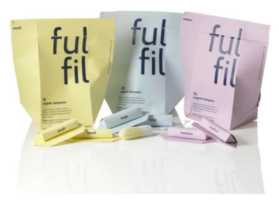
Public Award winner: fulfil