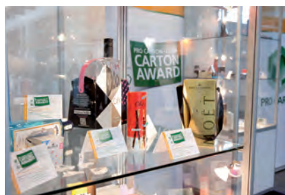
Pro Carton ECMA Award exhibition