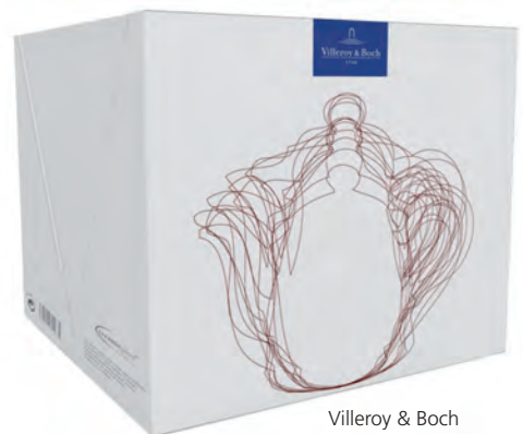
Villeroy & Boch