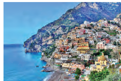
The town of Sorrento in the Gulf of Naples

The congress provides the European folding carton industry and their supply chain partners a unique opportunity to meet, exchange information and trends, and network at a spectacular location.