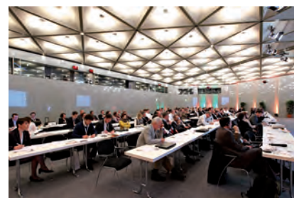
The joint ECMA Pro Carton Congress is a must for all decision makers