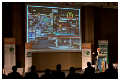
ECMA Congress in Dubrovnik