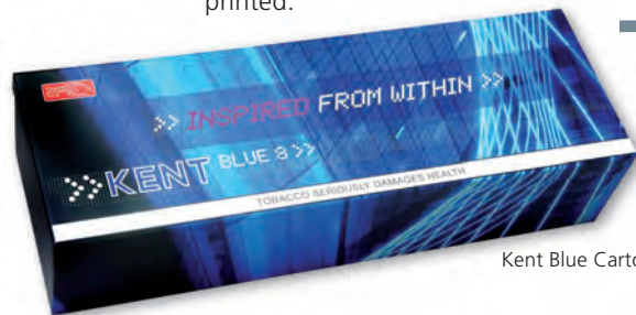
Kent Blue Carton

A new study by IDTechEX comes to the conclusion that the market for Smart Packaging – that is packaging enhanced with imprinted electronics – will grow from 75 million to 1.45 billion US dollars over the next ten years. The reason: imprinted electronics are to become 99 per cent cheaper soon, and cartons are of course the ideal media for all things printed.