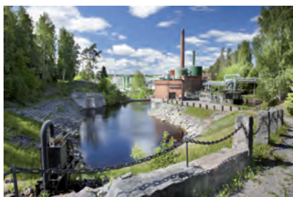
Metsä Board Kyrö mill

CEPI (Confederation of European Paper Industries) has published its latest report on the sustainability of the European pulp, paper and board industries. It shows that the whole industry, including cartonboard packaging, is focusing on innovation and resource efficiency while advancing the bio-based economy.