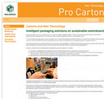
Pro Carton New Technology Website.

Today, Pro Carton launches a new website which shows how cartonboard packaging is the ideal medium for this role, by enabling intelligent packaging solutions which are creative and innovative, on a sustainable substrate.