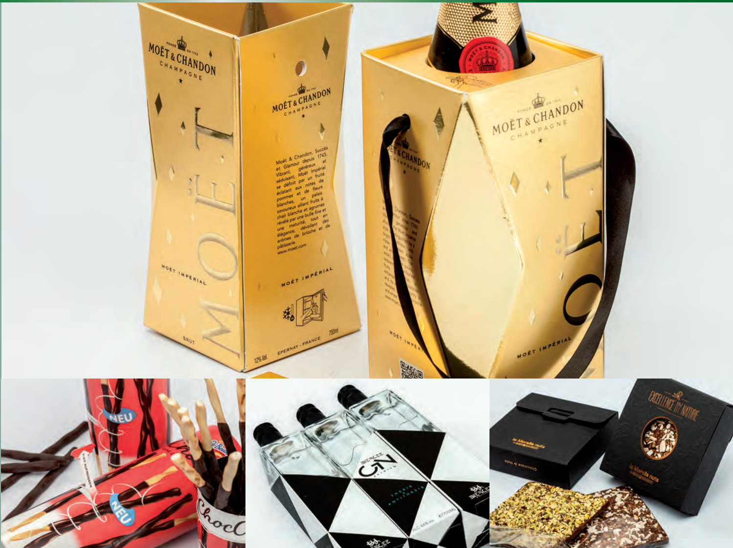
The complete texts of all E-News in 5 languages and images in ready-to-print quality at www.procarton.com/news