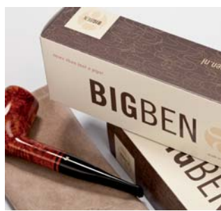
8 Aug. Heinrigs Druck + Verpackung GmbH & Co. KG