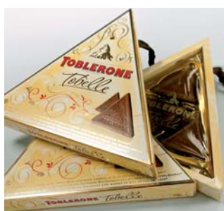
④ Model PrimePac AG