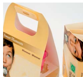
7 STI Group