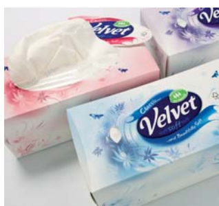
2 MM Packaging Behrens GmbH & Co. KG