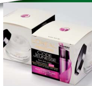
2 rlc packaging group