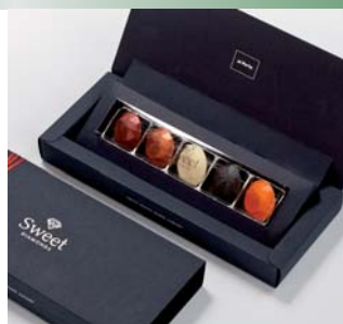
4 Fratelli Roda SA