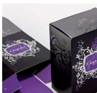
2 STI Group