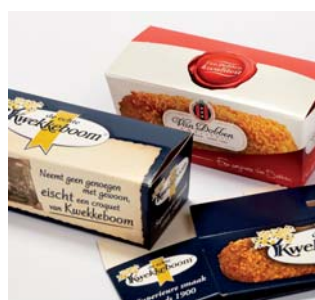
7 Acket drukkerij kartonnage bv