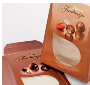
4 VG Kvadra Pak