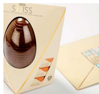
④ Schelling AG