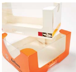
7 Schut Hoes Cartons bv