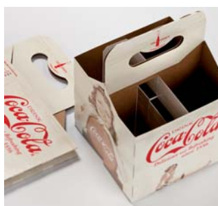
3 Smurfit Kappa Baden Packaging GmbH