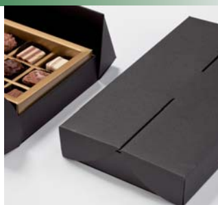
4 Model PrimePac AG