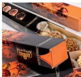
④ VG Kvadra Pak