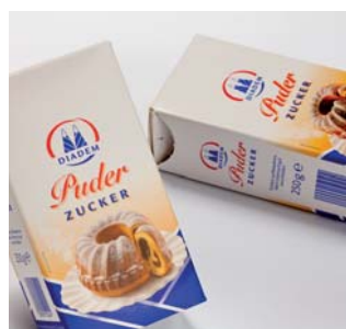
7 A&R Carton GmbH