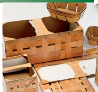
7 Karl Knauer KG