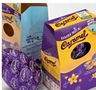
4 Chesapeake Branded Packaging