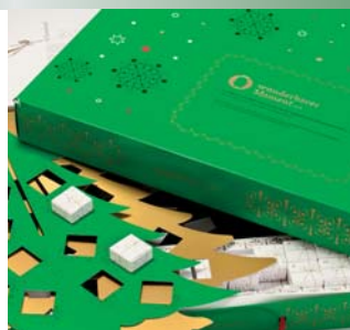
④ Offsetdruckerei Schwarzach GmbH