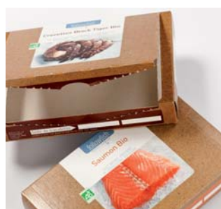
7 Smurfit Kappa Baden Packaging GmbH