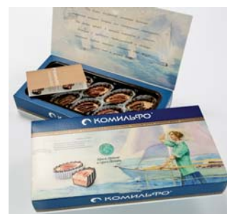
4 AR Carton