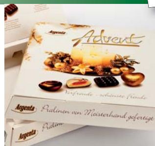
4 A&R Carton GmbH