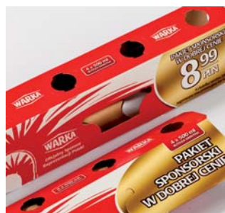
3 VG Polska. Z.o.o. member of Van Genechten Packaging Group