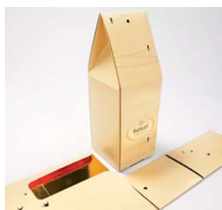
3 Van Genechten Packaging