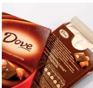
4 AR Carton