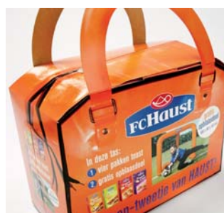
7 Contego Packaging