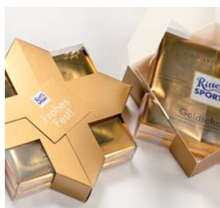
④ Chesapeake Branded Packaging Stuttgart