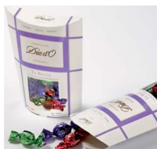
④ Chesapeake Branded Packaging Stuttgart