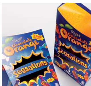
1 MMP Austria