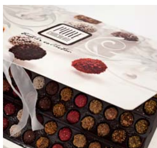
④ VG Kvadra Pak