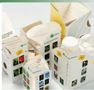
8 Karl Knauer KG