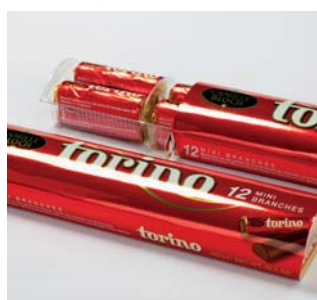
④ Schelling AG