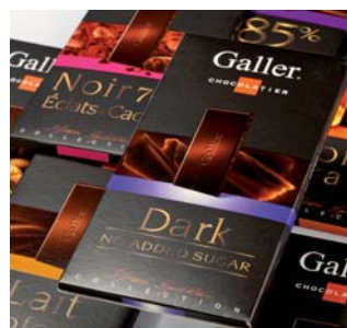
4 Van Genechten Biermans