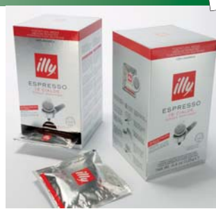
1 SA.GE Print