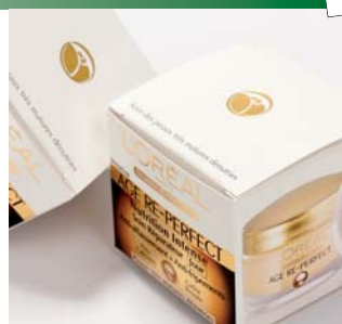
2 rlc packaging group