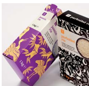
7 Smurfit Kappa Baden Packaging GmbH