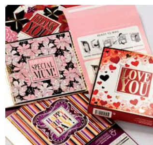
4 Hammer Lübeck Faltschachtelwerk