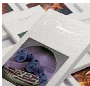
4 Hammer Lübeck Faltschachtelwerk