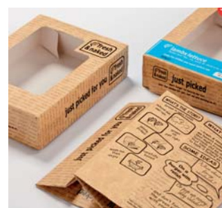
7 Alexir Packaging Ltd