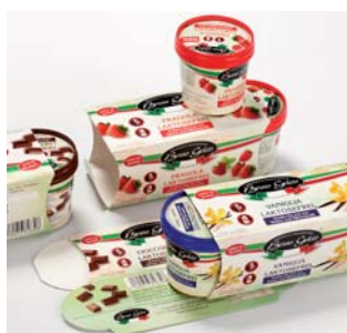
7 Hammer Lübeck Faltschachtelwerk