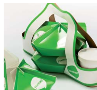
7 Mayr-Melnhof Packaging Austria GmbH