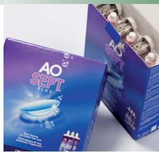
8 August Faller KG