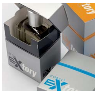
2 Print Park