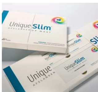
⑤ Intergrafipak B.V.