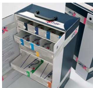
⑤ MMP Schausberger, Austria