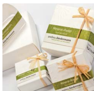
2 Aug. Heinrigs Druck + Verpackung GmbH & Co. KG