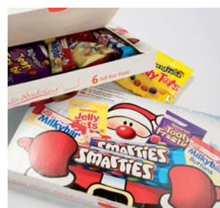
④ Mayr-Melnhof Packaging UK Limited