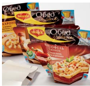
9 VG Kvadrupak, Riga