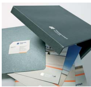
8 Siemer Kartonagen GmbH