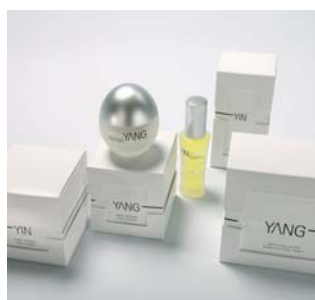
2 Carl Edelmann GmbH