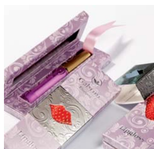
2 Print Park