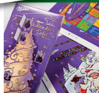
4 Van Genechten Biermans