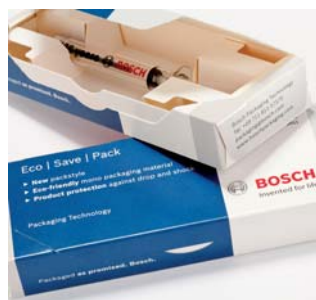
⑤ August Faller KG