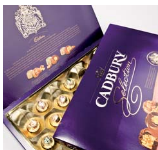
4 AR Carton