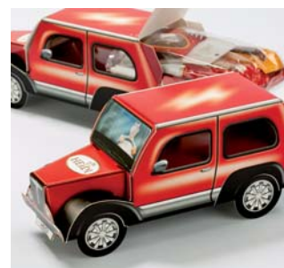
4 STI Petofi Nyomda Kft