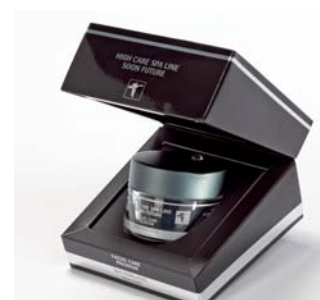
2 Aug. Heinrigs Druck + Verpackung GmbH & Co. KG