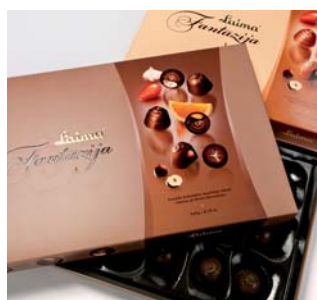
4 VG Kvadra Pak