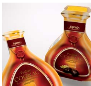
4 A&R Carton GmbH Frankfurt