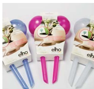
8 Acket drukkerij kartonnage bv