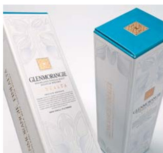
3 VG Angoulême of Van Genechten Packaging