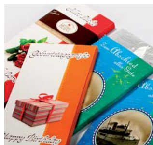
4 C.P. Schmidt Verpackungs- Werk GmbH & Co KG