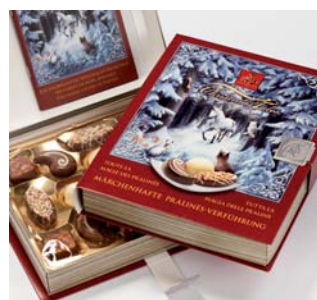
4 Schelling AG