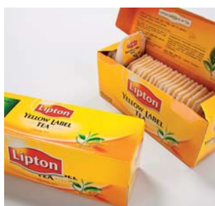
7 MM Polygrafoformlenie Packaging LLC