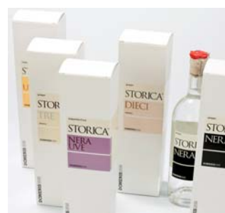
3 SA.GE Print