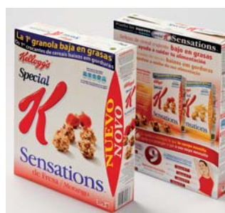
7 VG Polska. Z.O.o. member of Van Genechten Packaging Group