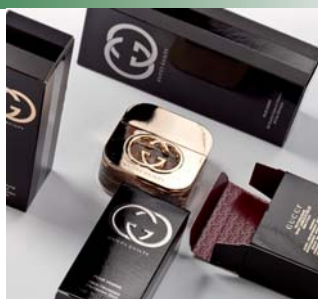
2 Carl Edelmann GmbH