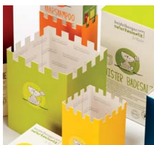
2 STI Group