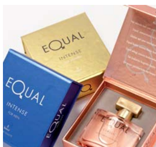
2 Print Park