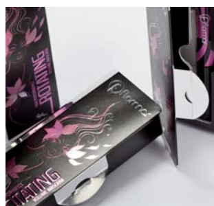
2 Print Park