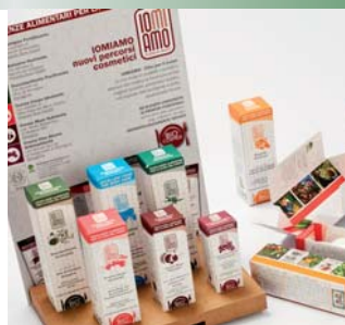
2 Sage Print S.p.A.