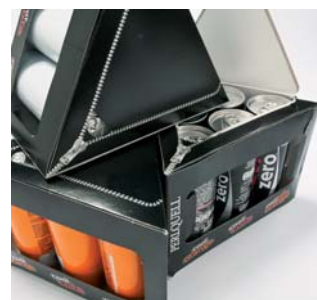
3 Smurfit Kappa Baden Packaging GmbH