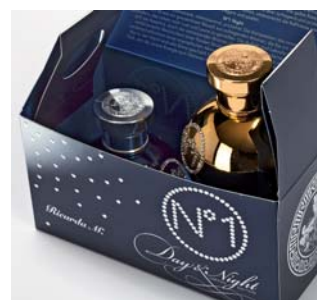
2 Aug. Heinrigs Druck + Verpackung GmbH & Co. KG