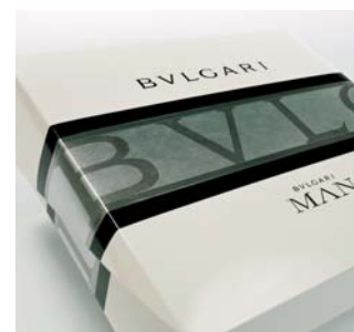
2 Pusterla 1880 SPA