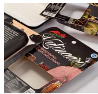
9 Stora Enso Packaging Oy DeLight Solution