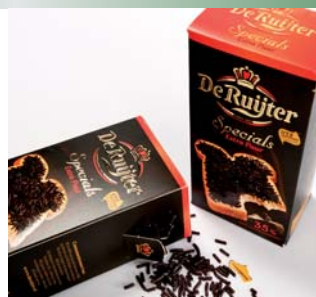
7 Acket drukkerij kartonnage bv