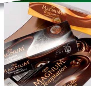
1 VG Nicolaus Kempten