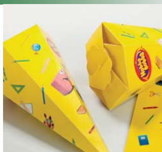
④ Schelling AG