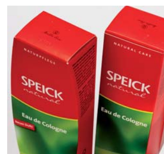
2 Chesapeake Branded Packaging Stuttgart GmbH