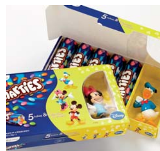
4 Chesapeake Branded Packaging Germany