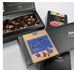
4 VG Kvadra Pak