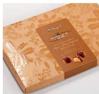
4 VG Kvadra Pak