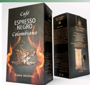
7 Chesapeake Branded Packaging