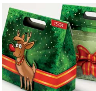
4 Cosack GmbH & Co.KG