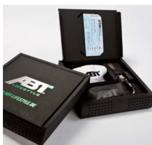
8 MMP Schausberger, Austria