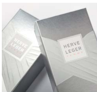
2 Clondalkin Poland