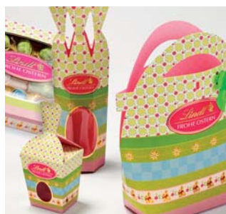
4 Aug. Heinrigs Druck + Verpackung GmbH & Co. KG