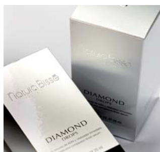
2 Alzamora Packaging