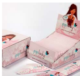
⑥ Alzamora Packaging