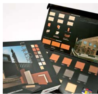
8 Siemer Kartonagen GmbH