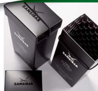
7 Ernst Schausberger & Co. Gesellschaft m.b.H.