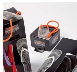
8 Friedrich Freund GmbH