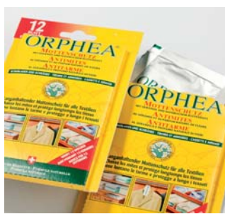
8 Fratelli Roda SA