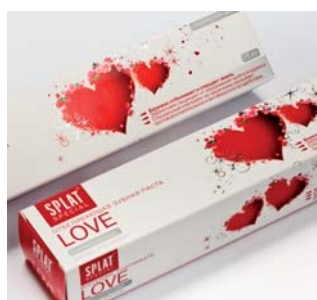
2 MM Polygrafoformlenie Packaging LLC