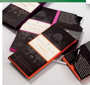
④ Model PrimePac AG