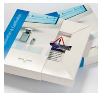
8 Acket drukkerij kartonnage bv