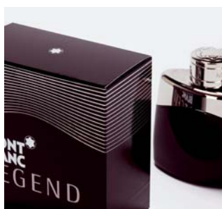
2 Carl Edelmann GmbH