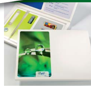
8 Schelling AG