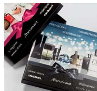
2 Model PrimePac AG