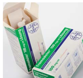
⑤ August Faller KG