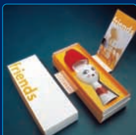
Field Rotopack Stuttgart