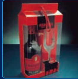
Alzamora Packaging S.A.