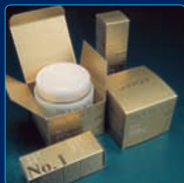
Model - Kramp GmbH