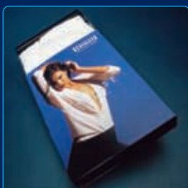
Model PrimePac AG