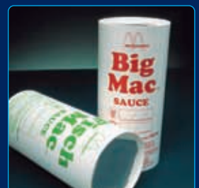
Van Genechten Packaging