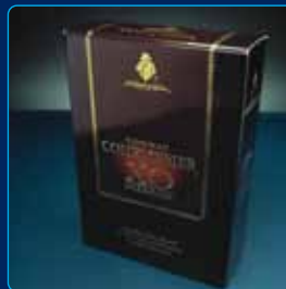
Van Genechten Packaging