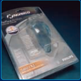
Drukkerij de Vries B.V.