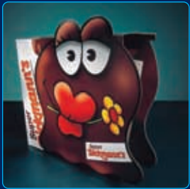
Field Rotopack Bünde