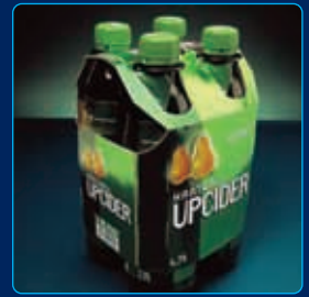
Å&R Carton OY