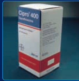
Faller Gruppe Werk St. Göppert GmbH & Co. KG