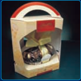
Field Rotopack Stuttgart