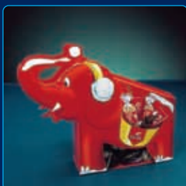
Van Genechten Packaging