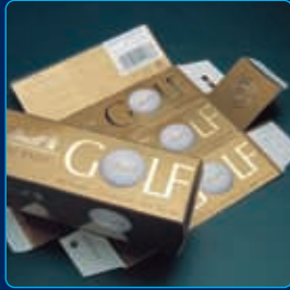
Mayr-Melnhof Packaging Austria