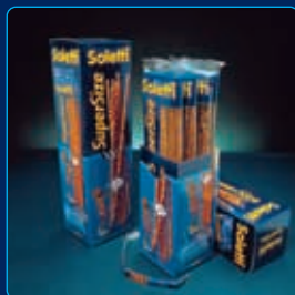
Alfred Wall AG