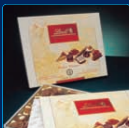
Model PrimePac AG