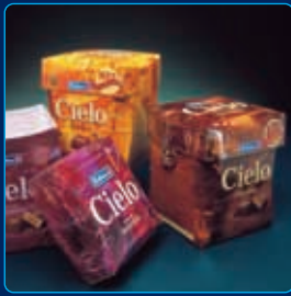
Van Genechten Packaging