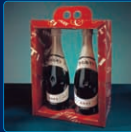
G.P.P. Industrie Grafiche S.p.A.