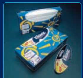
MMP/CP Schmidt Verpackungs-Werk GmbH & Co. KG