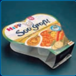
STI - Gustav Stabernack GmbH