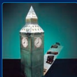
STI - Gustav Stabernack GmbH