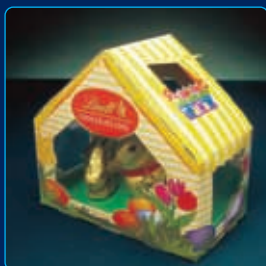
Carl Edelmann GmbH & Co. KG