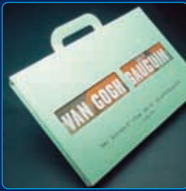
Schut Hoes Cartons B.V.