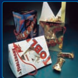
Model PrimePac AG