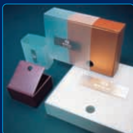
Cartografica Pusterla S.p.A.