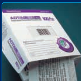
Field Boxmore Healthcare