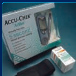
MMP/CP Schmidt Verpackungs-Werk GmbH & Co. KG