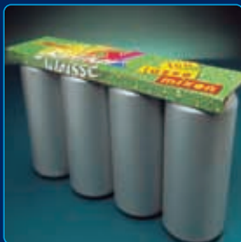
Wanfried-Druck Kalden GmbH