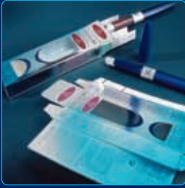
Model - Kramp GmbH