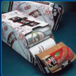
Riverwood International Ltd.