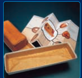
MM Packaging Caesar