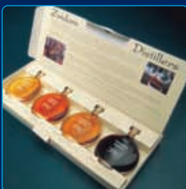
Schut Hoes Cartons B.V.