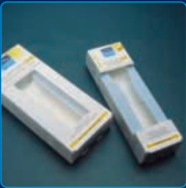
G.P.P. Industrie Grafiche S.p.A.