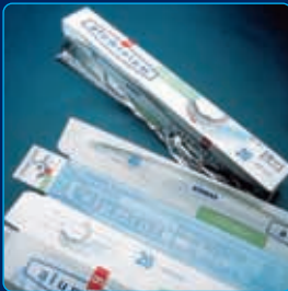
Acket Drukkerij-Kartonage B.V.