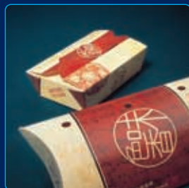
Cartonnagefabriek D. Miedema B.V.