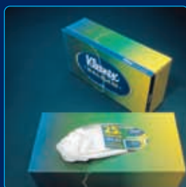
MMP/CP Schmidt Verpackungs-Werk GmbH & Co. KG