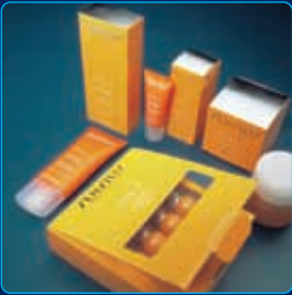
Linea Industrial de Envases S.A.