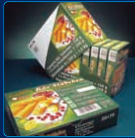
Mayr-Melnhof Packaging Austria