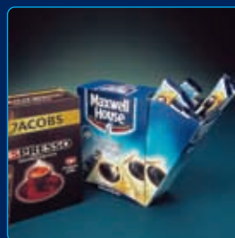
Van Genechten Packaging