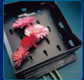
Cartonnage P. van de Velde NV