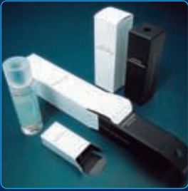
Carl Edelman GmbH & Co. KG