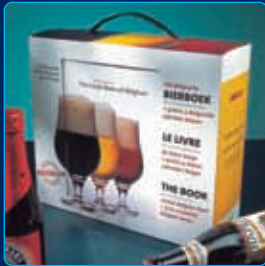
Schut Hoes Cartons B.V.