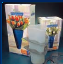
Acket Drukkerij-Kartonnage B.V.