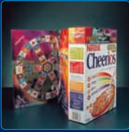
M.Y. Cartons B.V.