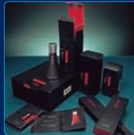
Carl Edelmann GmbH & Co. KG