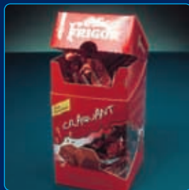
Model PrimePac AG