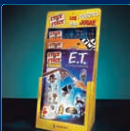
Alzamora Packaging S.A.