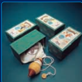
Envases Pendero S.L.