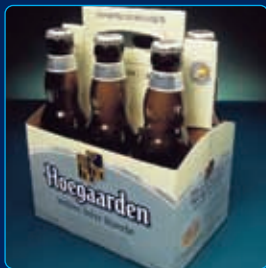
Mead Verpakking BV