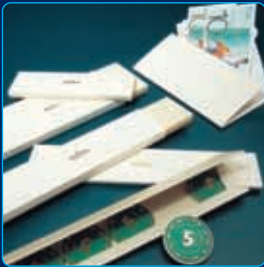
Mayr-Melnhof Packaging Austria