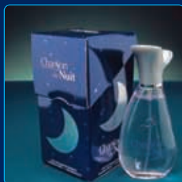
Alzamora Packaging S.A.