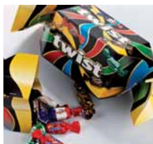
③ Model PrimePac AG