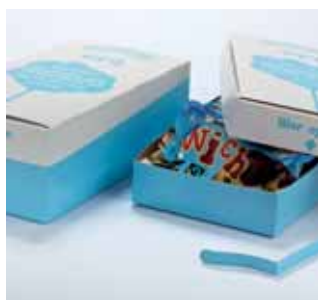
⑤ Contego Packaging