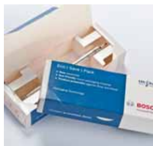
④ August Faller KG