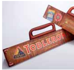
③ Model PrimePac AG