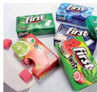
8 rlc packaging group