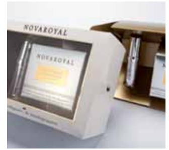
1 Marzek Group