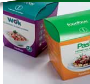
6 STI Petöfi Nyomda Kft.