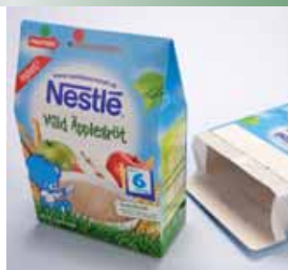
6 A&amp;R Carton Lund AB