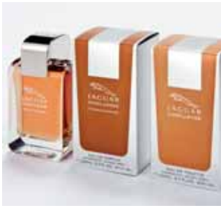
1 Carl Edelmann GmbH