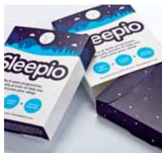
7 Firstan Ltd