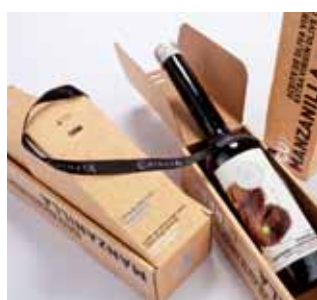
6 Karbest, S.L.