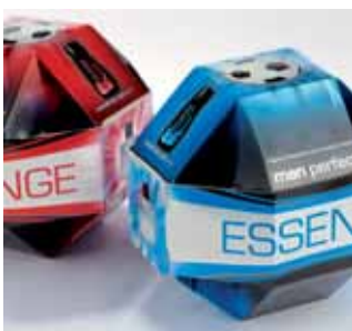
1 MMP Neupack Polska