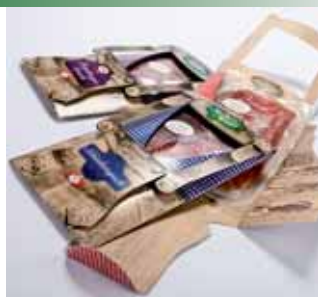
6 Schachner-Pack Gmbh