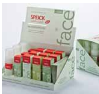
⑤ Chesapeake Branded Packaging