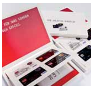
7 Bamberg kommunikation Höding Druck Heilbronn