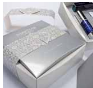
1 Karbest, S.L.