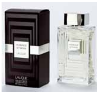
1 Carl Edelmann Group