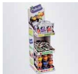
⑤ Lucaprint S.p.A.