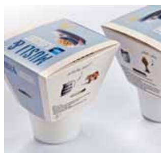
⑥ WS Quack & Fischer GmbH