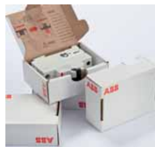
7 Lucaprint S.p.A.