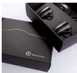
7 Siemer Kartonagen