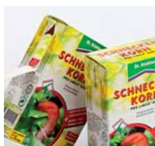
7 Karl Knauer KG