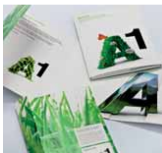
7 MMP Neupack