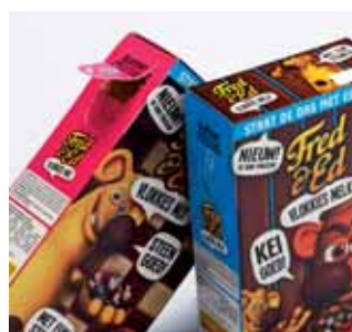
8 Contego Packaging