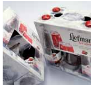
② Van Genechten Biermans