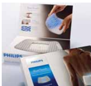
④ Smurfit Kappa Zedek