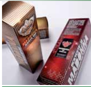
② Cartondruck GmbH