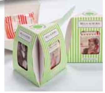
1 Karbest, S.L.