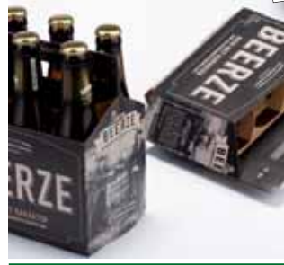
② A&R Carton BV