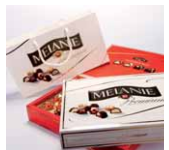
③ JV VG Kvadra Pak