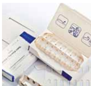
④ Carl Edelmann GmbH