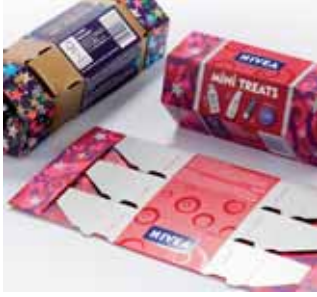
1 Clondalkin Pharma & Healthcare UK