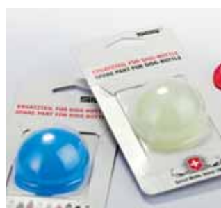
7 PAWI Verpackungen AG