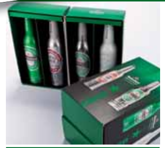
② Smurfit Kappa Zedek