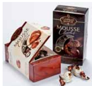
③ Schelling AG