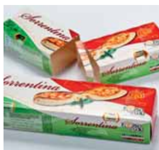
⑥ Boxmarche S.p.A.