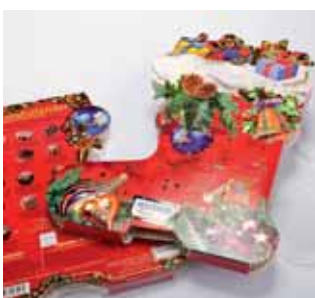
③ Chesapeake Stuttgart