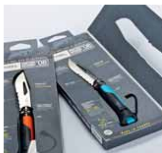
7 VG Angoulême