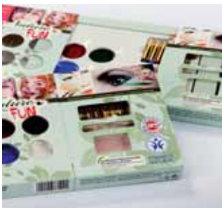
1 Schelling AG