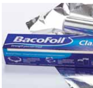
8 Lucaprint S.p.A.