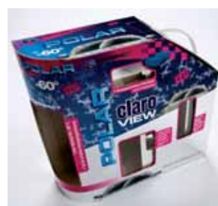
7 MMP Neupack