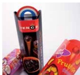
③ Eindhoven Packaging