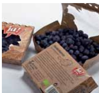
⑥ Ja! Natürlich, REWE Group Ratt