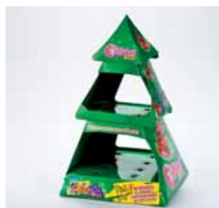
⑤ Gruppo Cartotecnico Abar Litofarma S.p.A.