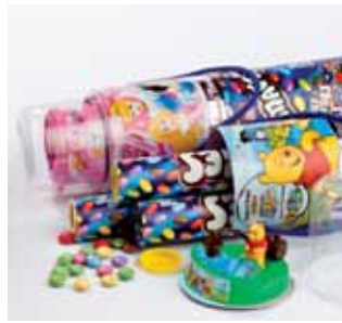
③ Chesapeake Branded Packaging