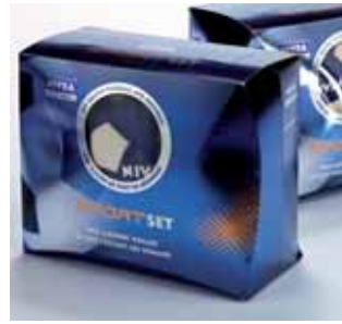
1 Chesapeake Branded Packaging - Stuttgart