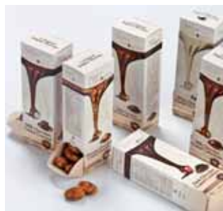
③ Edelmann Group