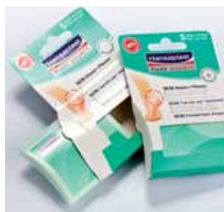
④ rlc packaging group