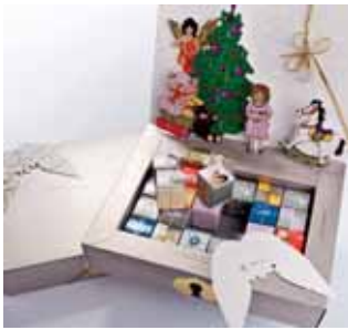
③ Offsetdruckerei Schwarzach GmbH