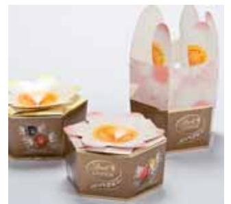
③ Model PrimePac AG