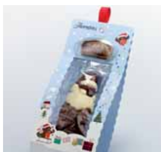
③ Clondalkin Pharma & Healthcare (Northampton)