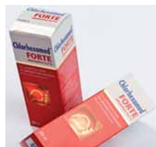
④ Karl Knauer KG