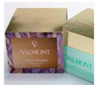
1 Pusterla 1880