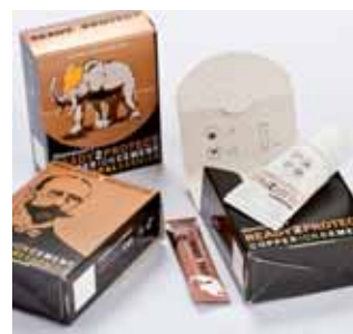
④ August Faller KG