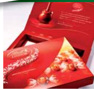
③ Chesapeake Branded Packaging