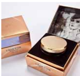
1 Cartondruck GmbH