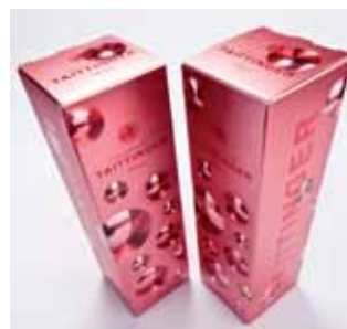
2 VG Angoulême