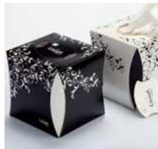
1 MMP CP Schmidt