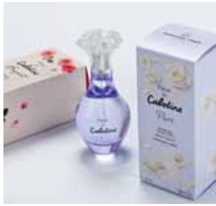
1 Carl Edelmann GmbH