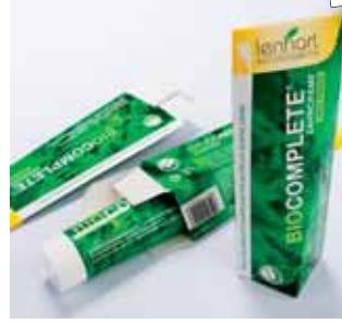
1 bandke consulting branding + design rlc packaging group