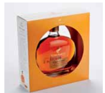
2 VG Angoulême