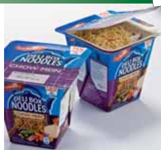
6 The Alexir Partnership