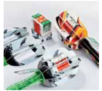
③ STI Group