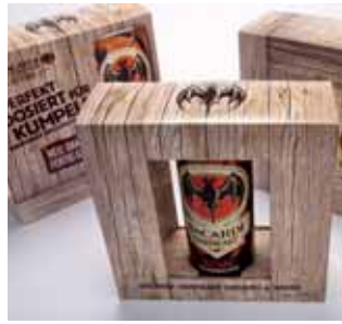
② STI Schröder Verpackungen GmbH