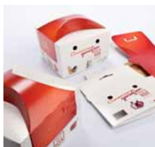
8 Van Genechten Biermans