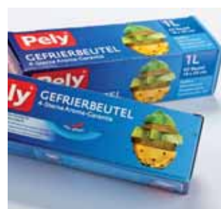
7 Redpack Brand Design Cosack