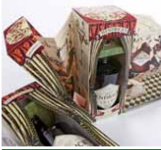
② Chesapeake Branded Packaging