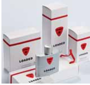
1 Carl Edelmann GmbH