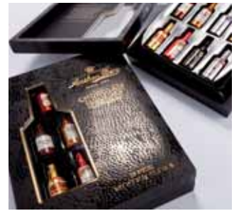
③ Chesapeake Branded Packaging