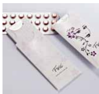
④ Carl Edelmann GmbH