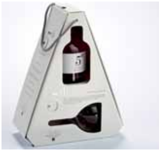
② Alzamora Packaging